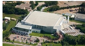
Chithra Karunakaran (Canadian Light Source)